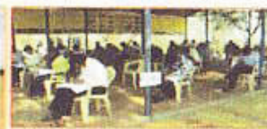
Common Entrance Exam

Indian Armed Forces are looking for good men & women. For the best and the brightest amongst you, intellect, idealism and courage and who can lead and inspire others Indian Armed Forces promises both professional and personal growth at every stage of the career.